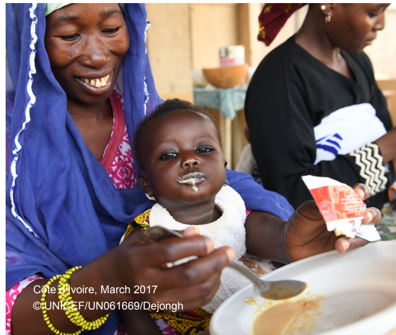
Côte d'Ivoire, March 2017

CVA does not change the way nutrition practitioners define objectives and select nutrition response options (e.g. treatment through community-based management of acute malnutrition, infant and young child feeding, supplementary feeding, micro-nutrient supplementation, etc.) in order to address identified nutritional needs. 8 ROA can help to identify the timing of potential response and the choices available in terms of responding to a number of concurrent nutritional needs in a given context. CVA does add additional modalities for the implementation of these response options. In contexts where communities face economic barriers to the underlying determinants, feasible CVA modalities and approaches should be considered as part of response options analysis. The five main approaches 9 for using CVA in nutrition response are: