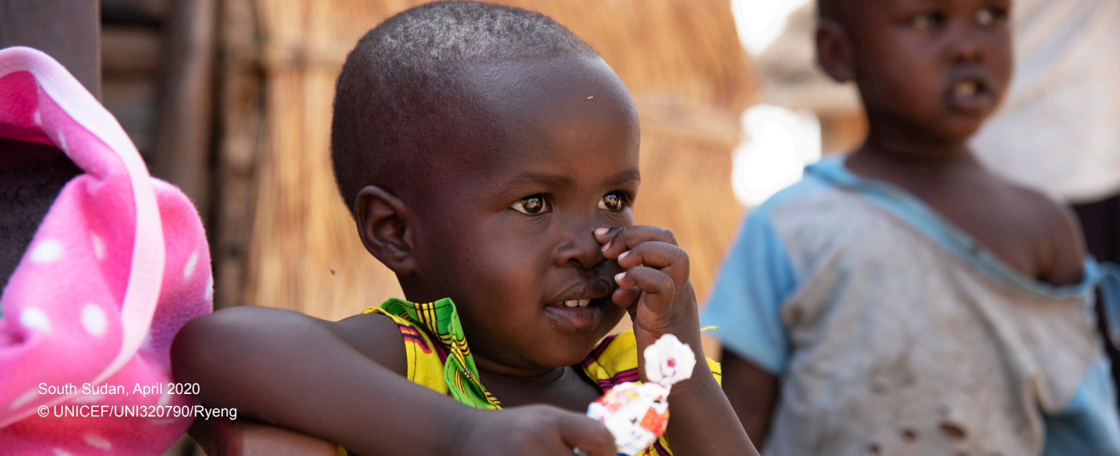
South Sudan, April 2020

Harmonized MEBs, MFBs and transfer amounts for household cash transfers exist in most humanitarian settings. Nutrition practitioners should work with existing MEBs and MFBs as well as transfer amounts and adjust these as required to meet programme objectives. If necessary, practitioners should advocate for adjustments to these tools to reflect a stronger focus on nutrition. If there is an ongoing process to develop or revise an MEB or MFB, the nutrition sector should participate to make sure that nutrition considerations are adequately reflected.