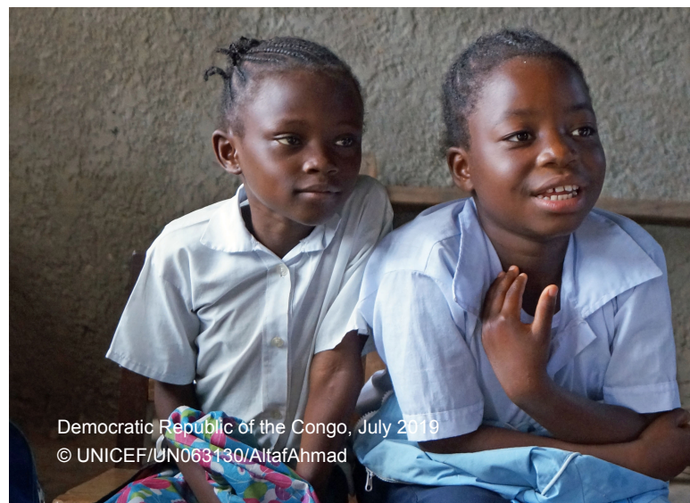
Democratic Republic of the Congo, July 2019

Market monitoring is required to have up-to-date information on the value of the transfer in terms of what it can buy. In volatile contexts, the transfer amount may need to be adjusted in line with market prices or there is a risk of compromising the intended nutrition outcome. In many humanitarian contexts, systems to assess and monitor markets for food and non-food items are already in place. As such, the nutrition sector does not necessarily have to collect additional market information.