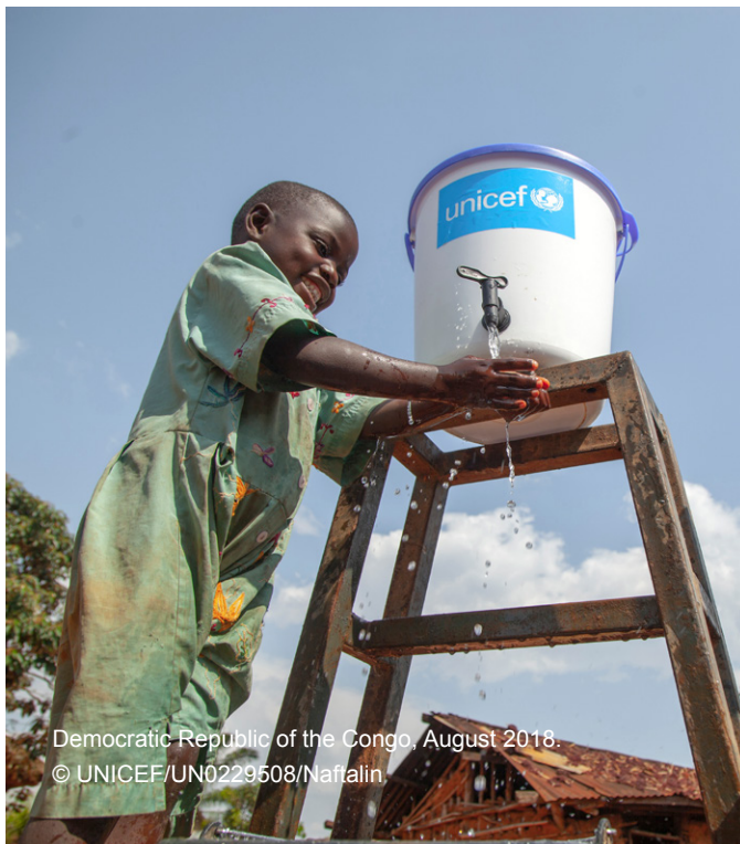
Democratic Republic of the Congo, August 2018.