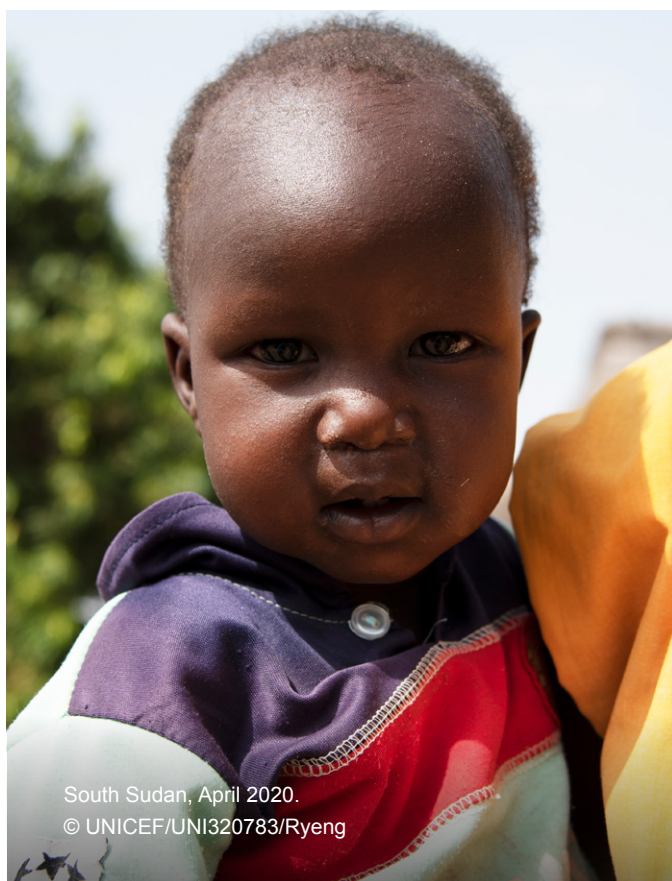
South Sudan, April 2020.