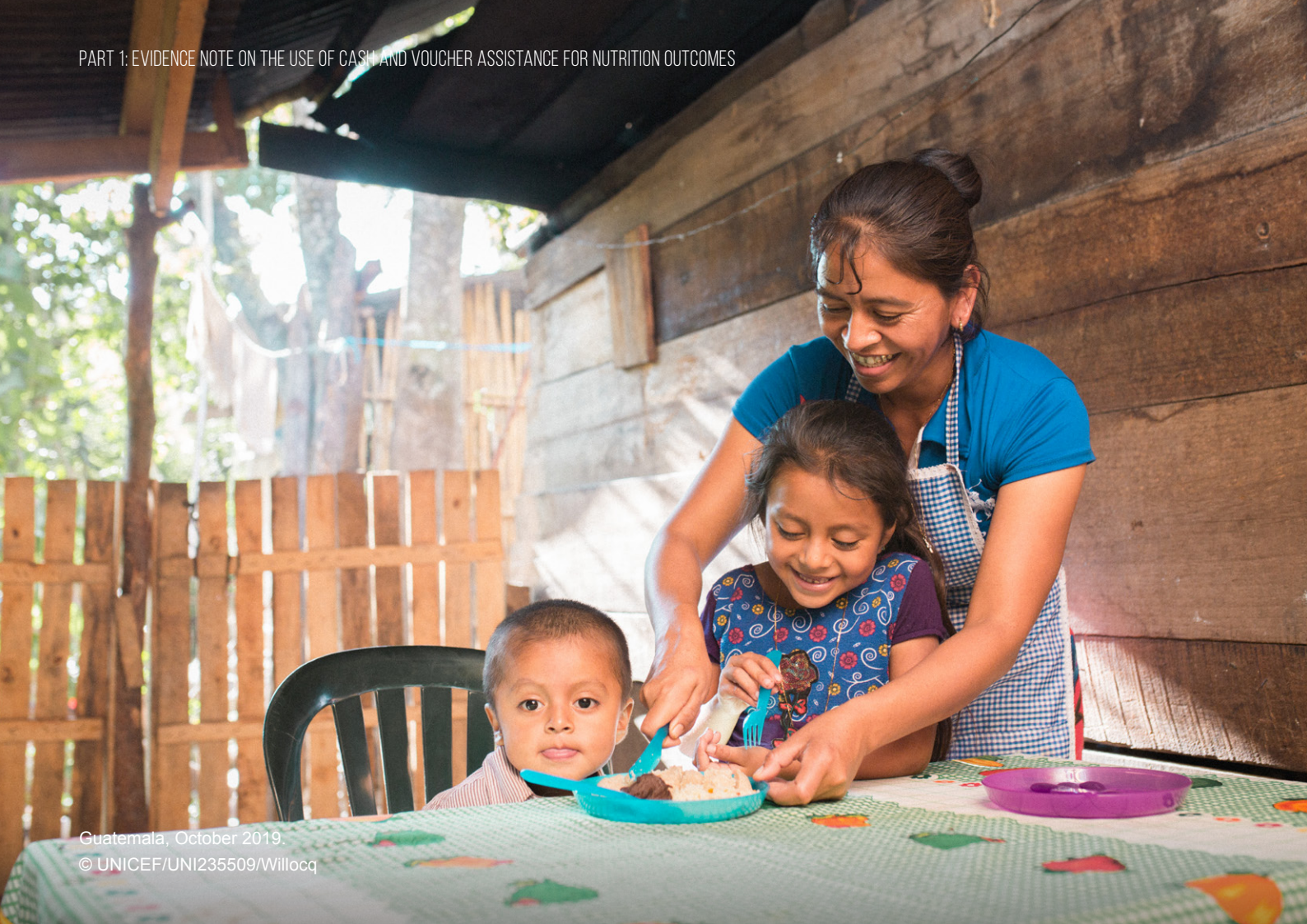
Guatemala, October 2019.