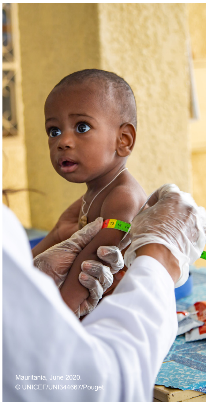
Mauritania, June 2020.