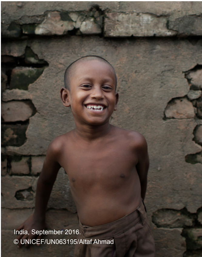
India, September 2016.