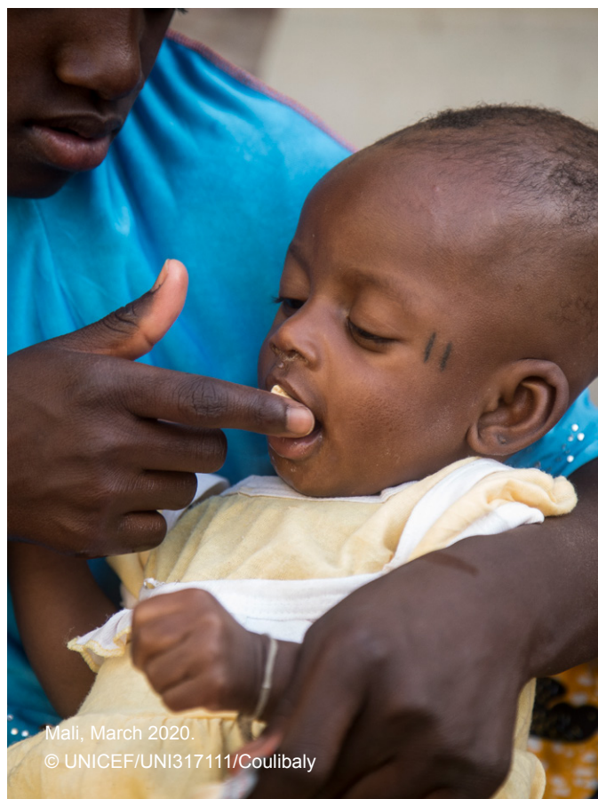
Mali, March 2020.

There are various barriers to seeking and accessing health services both on the demand and supply sides. If economic barriers are an important factor inhibiting health seeking, cash transfers conditional on attending priority preventive health