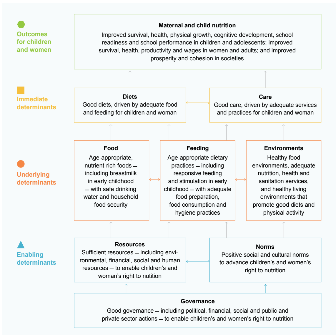
Figure 1. UNICEF Conceptual Framework on the Determinants of Maternal and Child Nutrition, 2020. A framework for the prevention of malnutrition in all its forms.