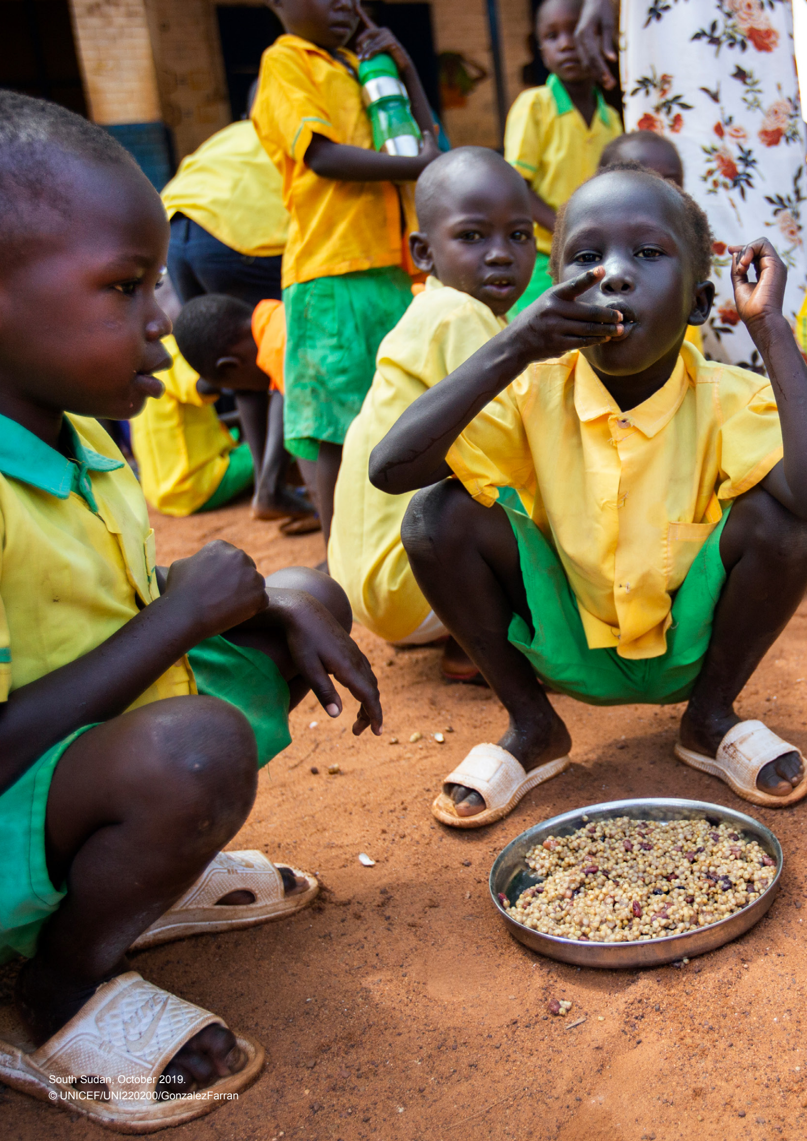
South Sudan, October 2019.