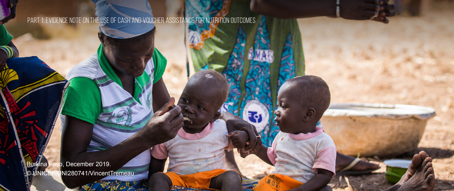
Burkina Faso, December 2019.