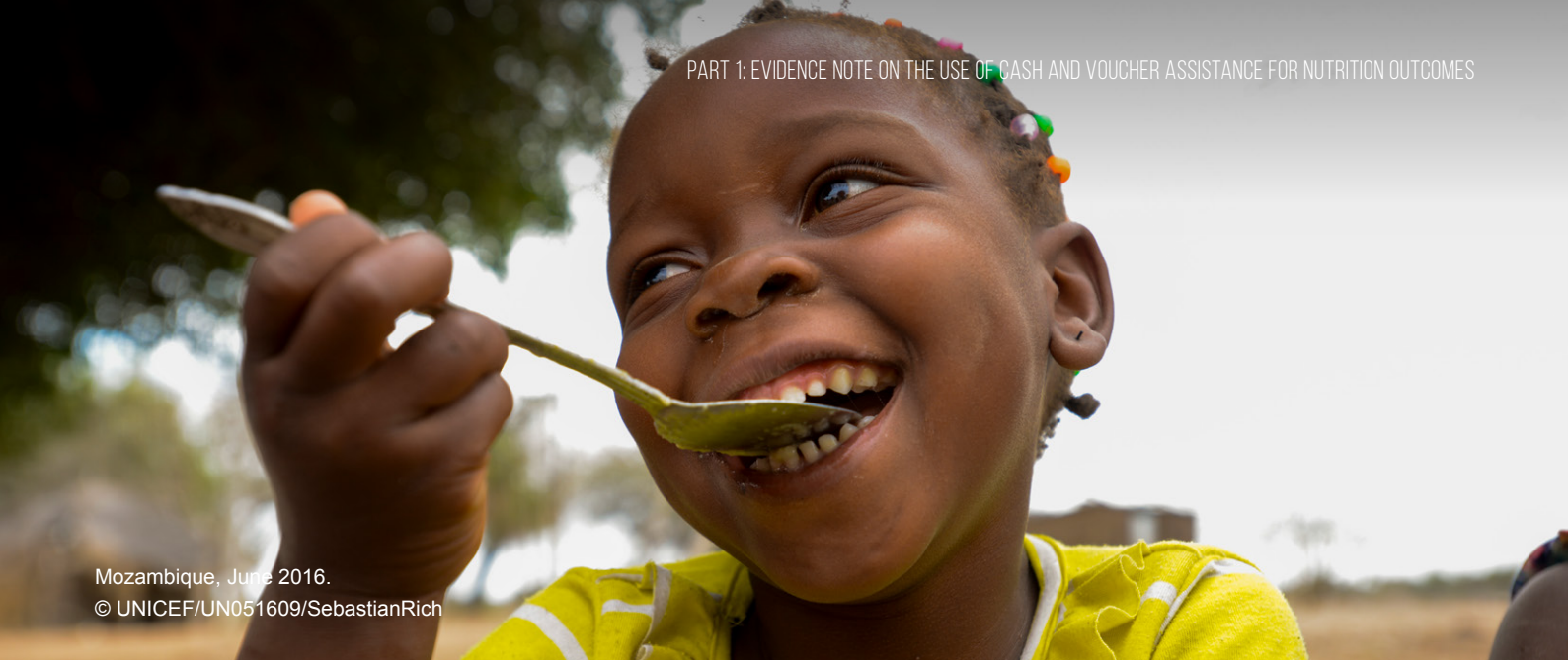
Mozambique, June 2016.

In its 2019 State of the World's Children report, UNICEF updated its conceptual framework on the causes of malnutrition (see Figure 1 ), acknowledging the evolving and multiple nature of maternal and child malnutrition and incorporating new knowledge on the drivers of malnutrition.