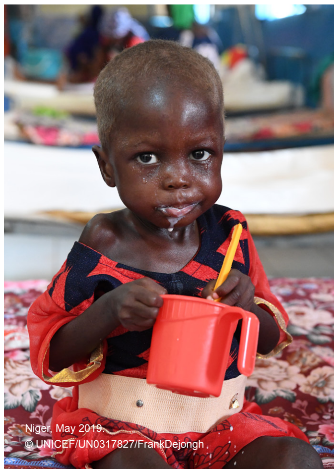
Niger, May 2019.

Duration and timing of assistance to prevent acute malnutrition irrespective of the modality should be based on the scale and severity of the emergency, the GAM prevalence and other factors such as food security, seasonality of food security and/or epidemic patterns of infectious diseases (GNC, 2017). Household or individual CVA for nutrition outcomes that aim to provide a safety net during the first 1,000 days can be provided throughout that period. Irrespective of the specific objective, household or individual CVA should not be provided for less than three months. Timeframes that are too short are unlikely to have any impact on nutrition outcomes. As for the frequency of transfers, regular (e.g. monthly) transfers are recommended if CVA aims to provide access to a diverse and nutritious diet.