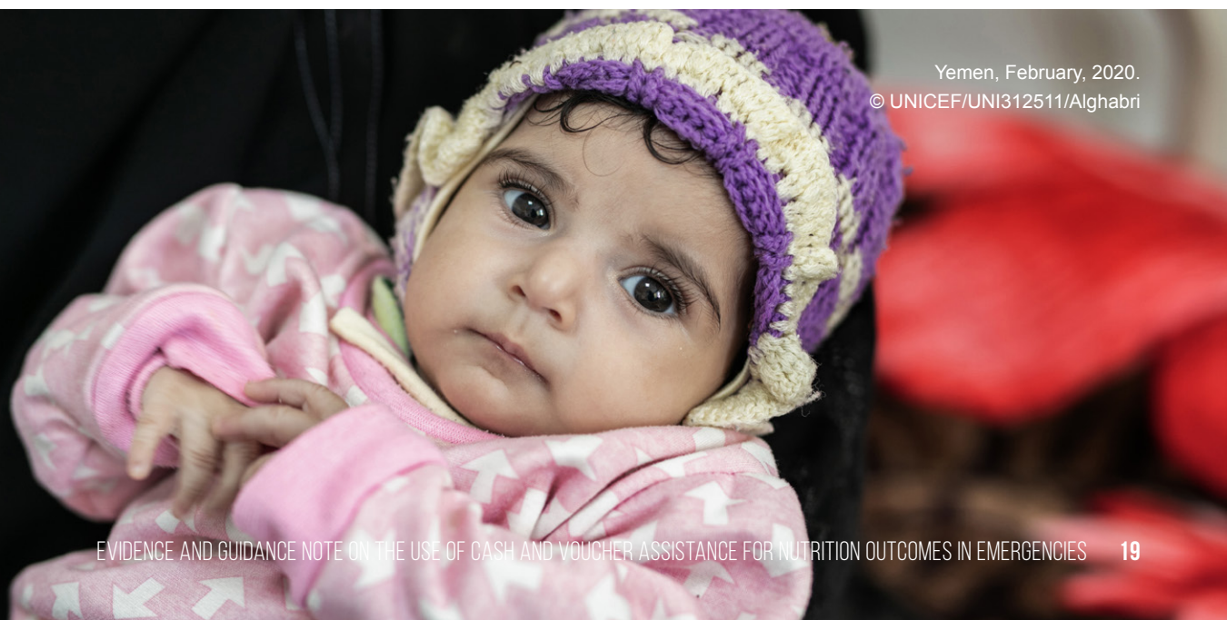
Yemen, February, 2020.

As for the frequency of transfers, some evidence from development settings suggests that regular payments (e.g. monthly) have a greater short-term impact on nutrition outcomes and the underlying causes of undernutrition, such as food expenditure, while less frequent and lump sum transfers are more likely to be invested in productive activities such as agricultural production (Fenn, 2015). Ecker et al. (2019) assess the mitigation effect of the national cash transfer programme of the Social Welfare Fund on child malnutrition in Yemen. They found that the mitigation effect tends to be larger the more regular payments are received, as regular assistance allows beneficiary households to regulate their food consumption and other demands influencing child nutrition outcomes.