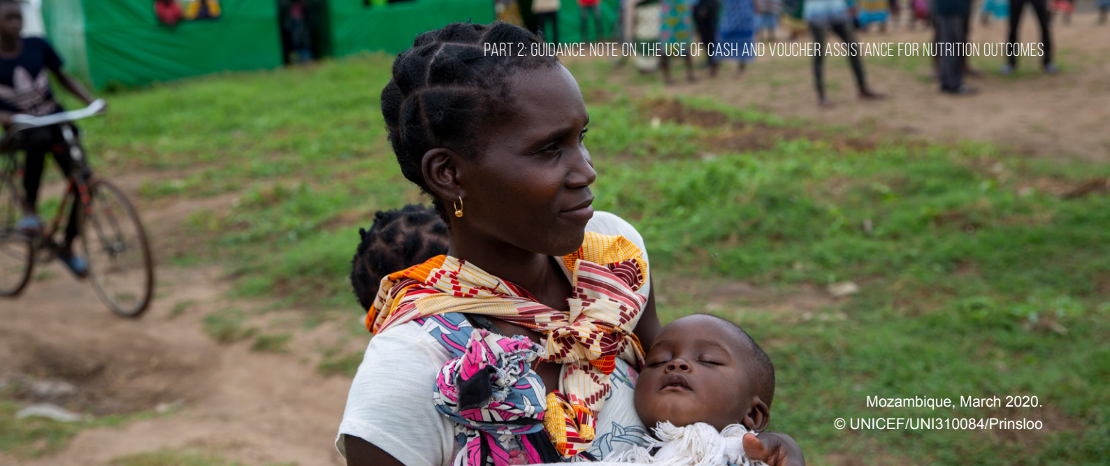
Mozambique, March 2020.