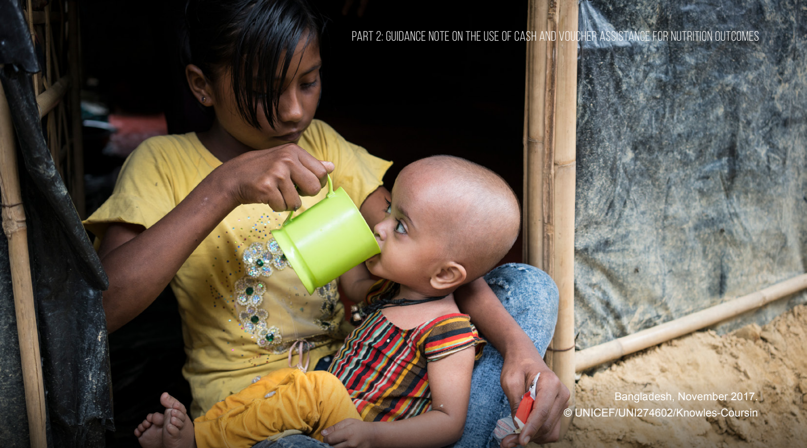
Bangladesh, November 2017.