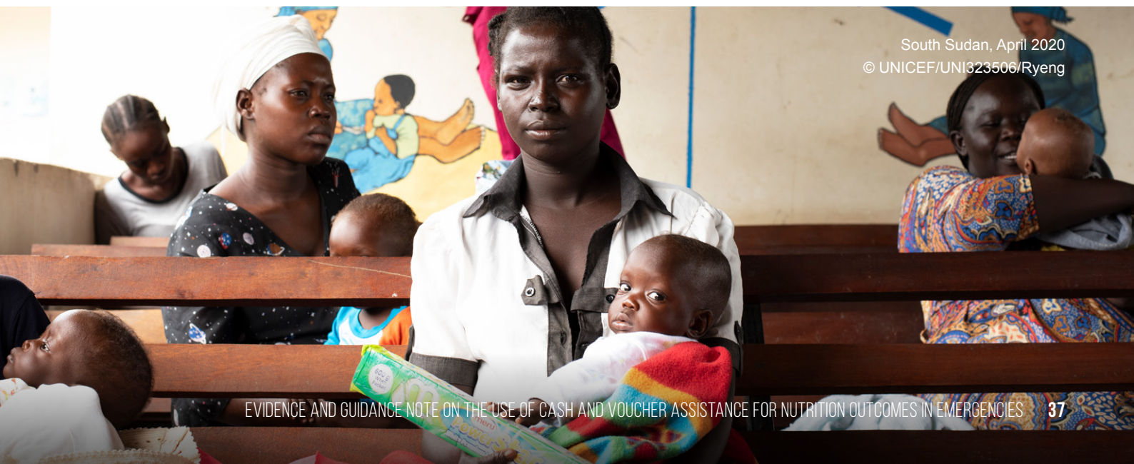
South Sudan, April 2020