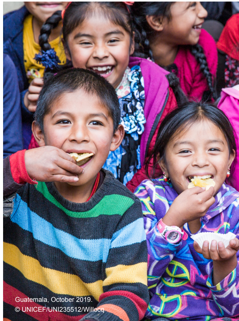
Guatemala, October 2019.

A cash transfer amount that is based on the macro- and micro-nutrient requirements of an individual or a household would not require an additional top-up. In reality, transfer amounts are usually calculated on an average household size and average macro- and (rarely) micro-nutrient requirement per person. Therefore, an individualized cash top-up in addition to household cash assistance can be justified to account for the detailed household composition and the additional nutrient needs of at-risk groups to prevent malnutrition. No operational experience for such cash top-ups was found. Langendorf et al. (2014) looked at the provision of household cash transfers plus a cash top-up to buy locally available nutritious foods as one of seven preventive strategies. They found that household cash transfers plus the top-up was significantly less effective in preventing malnutrition than providing household cash transfers plus supplementary nutritious foods for the children.