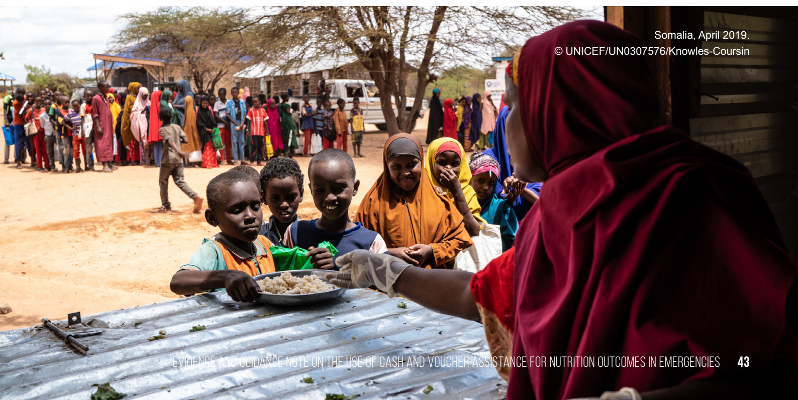
Somalia, April 2019.