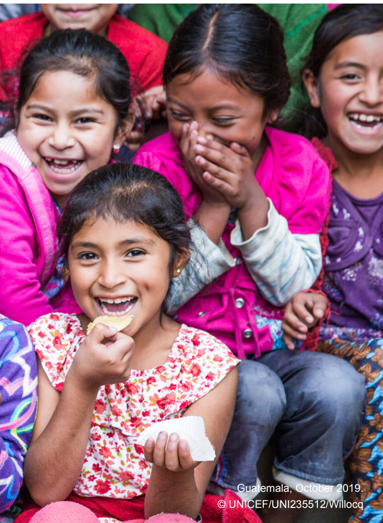
Guatemala, October 2019.