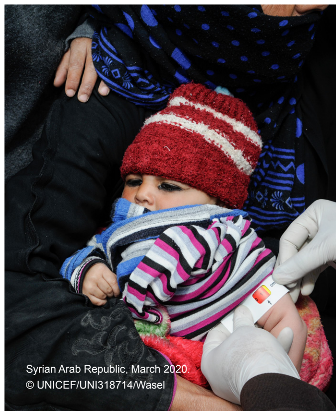
Syrian Arab Republic, March 2020.

Considerations in targeting CVA components involve the definition of the eligibility criteria for CVA, finding people that fulfil these criteria and the decision on who should physically or electronically receive CVA. The targeting criteria are largely determined by the programme objectives and type of response rather than the assistance modality. Interventions aimed to prevent malnutrition usually target households and individuals that are most at-risk to malnutrition. Interventions aimed at treating malnutrition target based on nutrition status, i.e. malnourished children 6 to 59 months of age, malnourished PLW and malnourished people living with chronic illness such as HIV or tuberculosis (GNC, 2017). The MAM decision tool for emergencies (GNC, 2017) provides more details and additional considerations on targeting for nutrition prevention interventions.