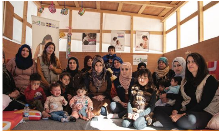
Baby Friendly Space in Arsal, Lebanon in 2020.