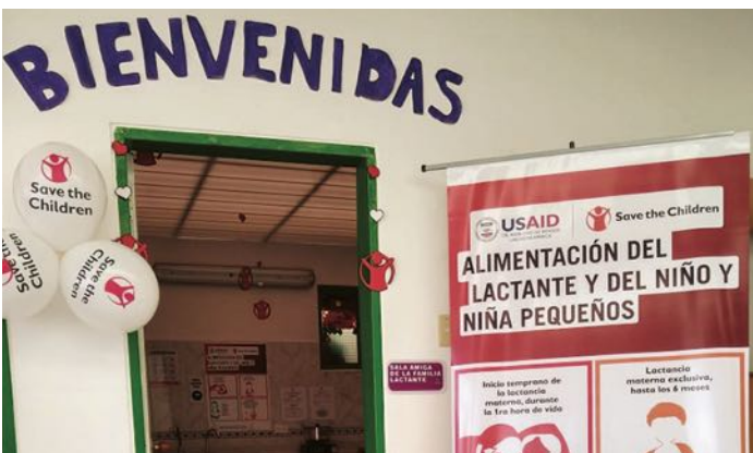
IYCF Corner. Save the Children Colombia