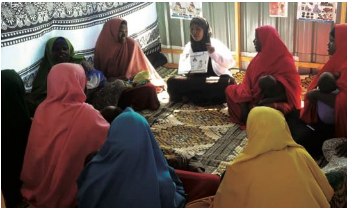
Mother Baby Area – Save the Children Somalia