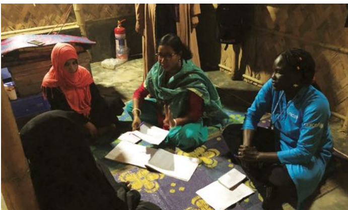
Breastfeeding support corner, Cox's Bazar. UNICEF