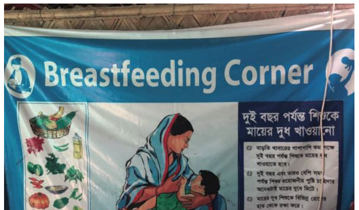
Key messages at the breastfeeding support corner, Cox's Bazar.