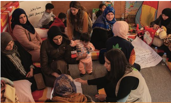
Baby Friendly Space in Arsal, Lebanon in 2020.