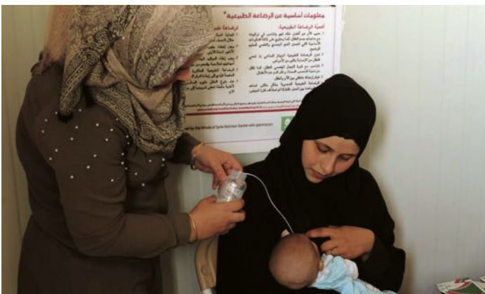
Relactation support in a Mother Baby Area. Save the Children Syria