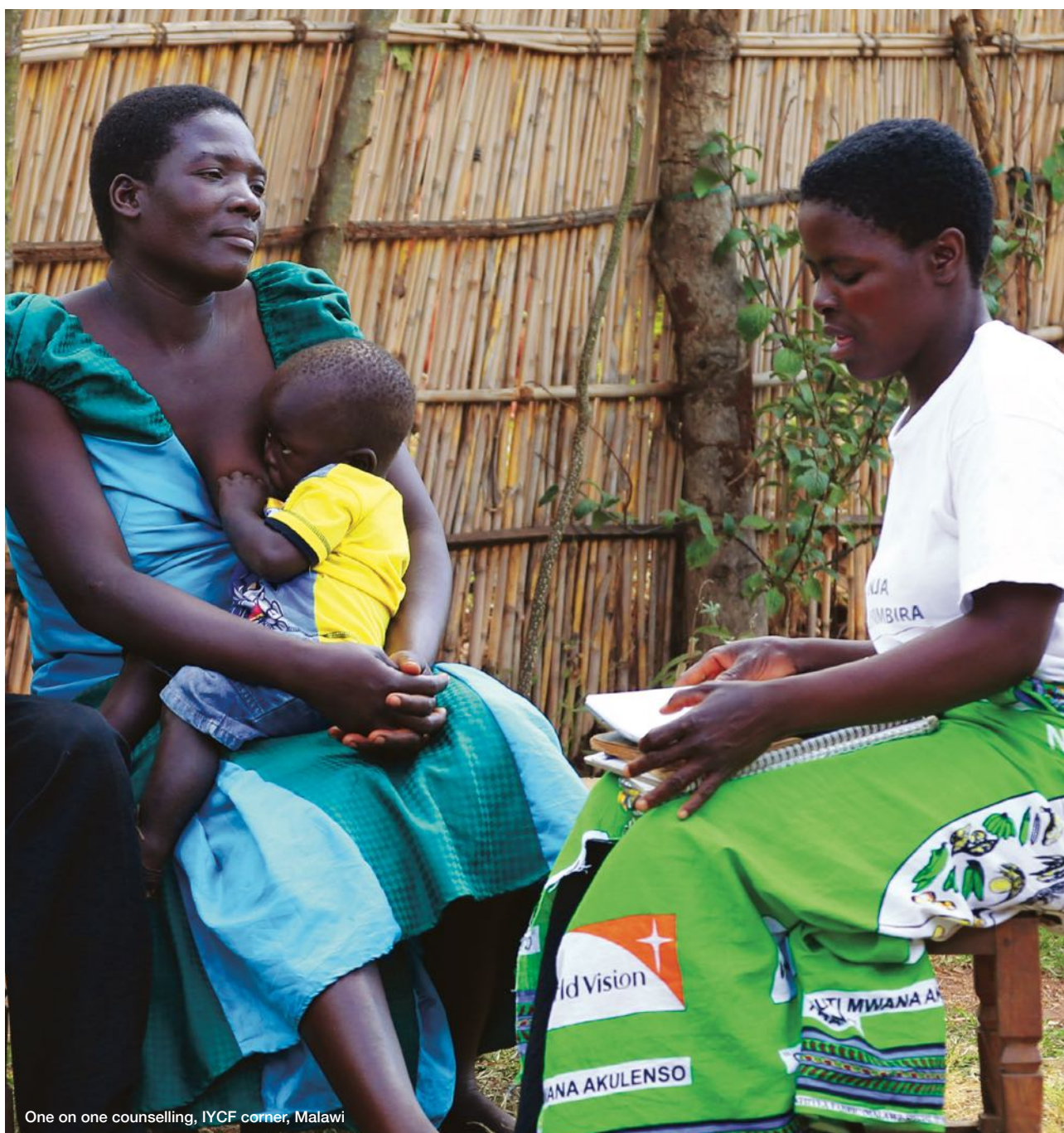
One on one counselling, IYCF corner, Malawi

women, adolescents and young children. The model has a specific health and nutrition focus, with support for IYCF-E as a core intervention, along with assessment and referral to higher care for health and nutrition needs, and provision of a recreational/social space for women, adolescents and young children. Each WAYC is contextualised to the community and the disaster event. WAYCs may include activities that will support other sectors, including protection, livelihoods, food security and WASH, depending on the context.