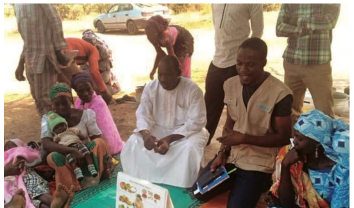
IYCF-E activities in the community, Northern Nigeria, May 2020. UNICEF