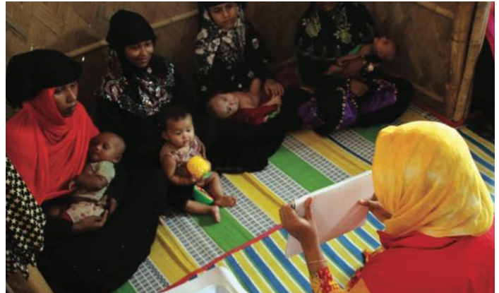
Group education in Mother Baby Area in Cox's Bazaar for the Rohingya Response.