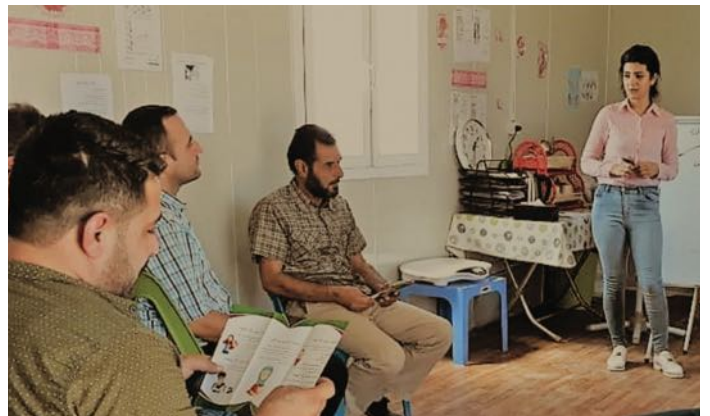
Fathers group in Syria.