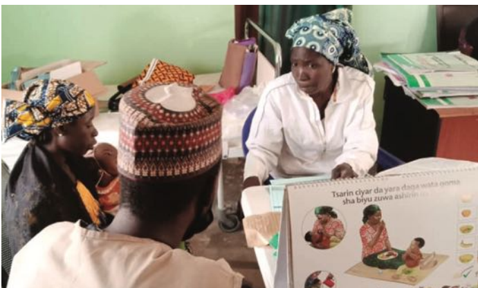
IYCF corner, Northern Nigeria, May 2020.