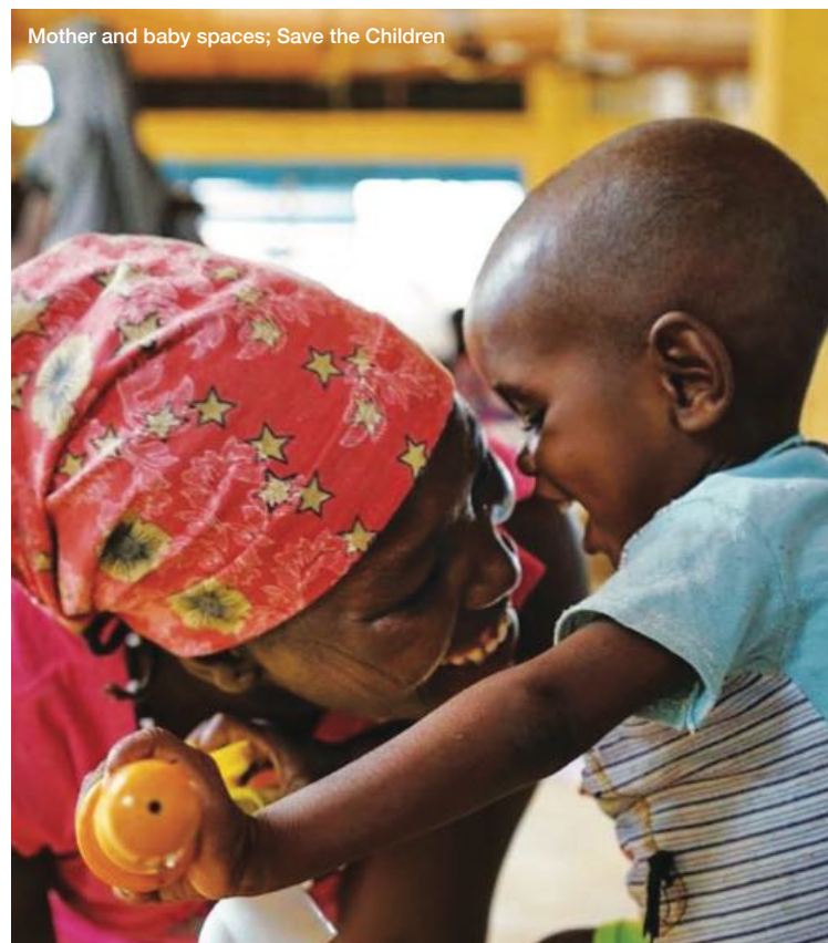
Mother and baby spaces; Save the Children

If capacity is limited, targeting criteria may be adjusted (e.g., limited to caregivers experiencing YCF or MHPSS difficulties) as a last resort.