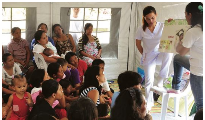
Woman and Young Child Space (WAYCS) for the Typhoon Haiyan Response.