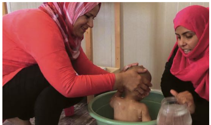
Baby Bath in Mother Baby Area. Save the Children Syria